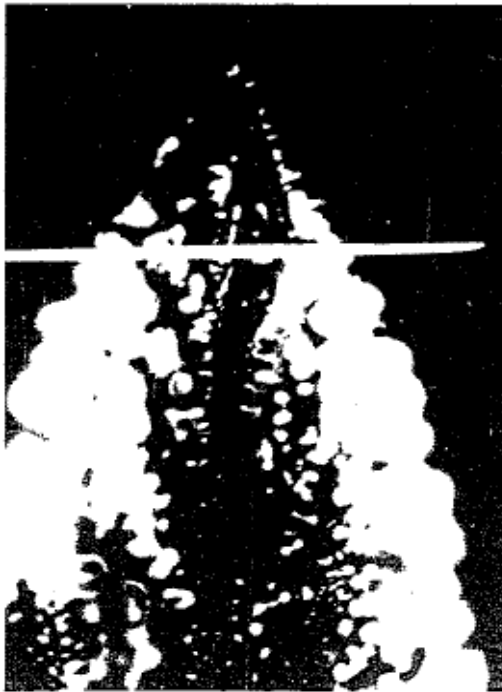
Leaf has been cut where white line is. Everything above the white line is invisible to the eye.

innate skills of controlled OOB, and data reliability is uncertain. These problems can be attributed to lack of observation skills of the subject as well as the complexity of the phenomena involved.