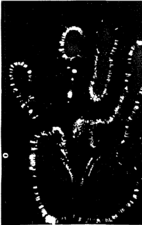
Hand of "healer" at rest

Two major problems presently exist in the implementation of this program: Only certain individuals have demonstrated