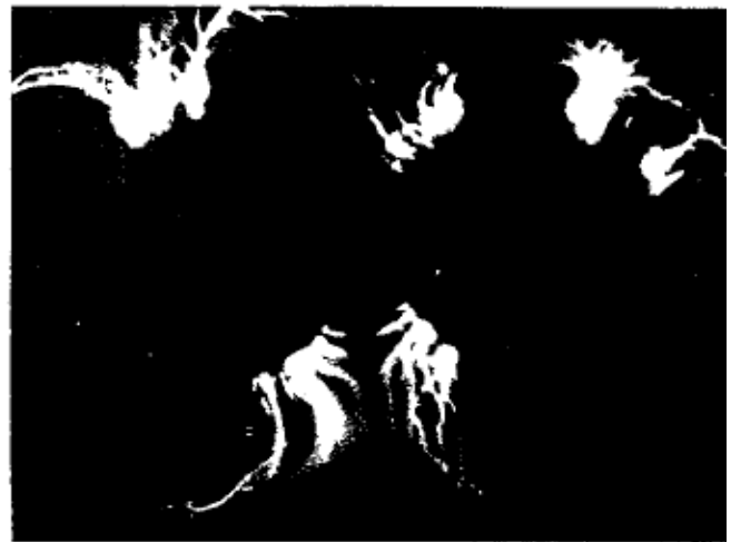
Two persons (repulsion)

Scientific experimentation has also been conducted with OOB. Test subjects have induced OOB states while being physiologically monitored and have retrieved data that was not available through normal means. Experiments frequently include identification of random numbers either placed out of sight nearby or at a more distant location. A distinct electroencephalogram (EEG) pattern called Alphoid has been isolated during tests, thereby indicating that this state is detectable through accepted physiological monitoring methods. Although some tests