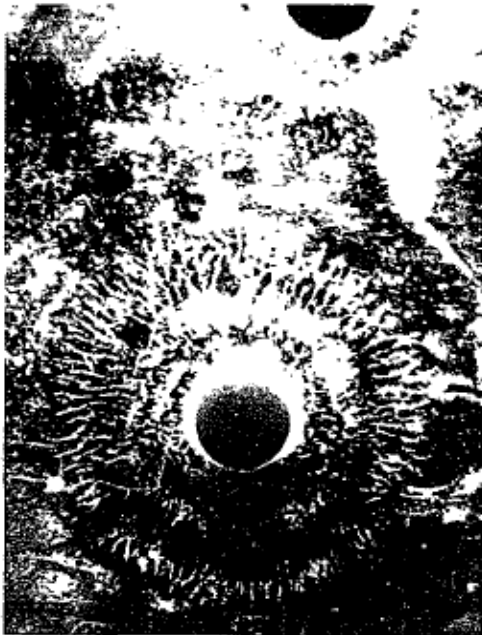
Liquid crystals (blood)

were successful, others were not, leading to the conclusion that an extremely complex phenomenon was involved. 10