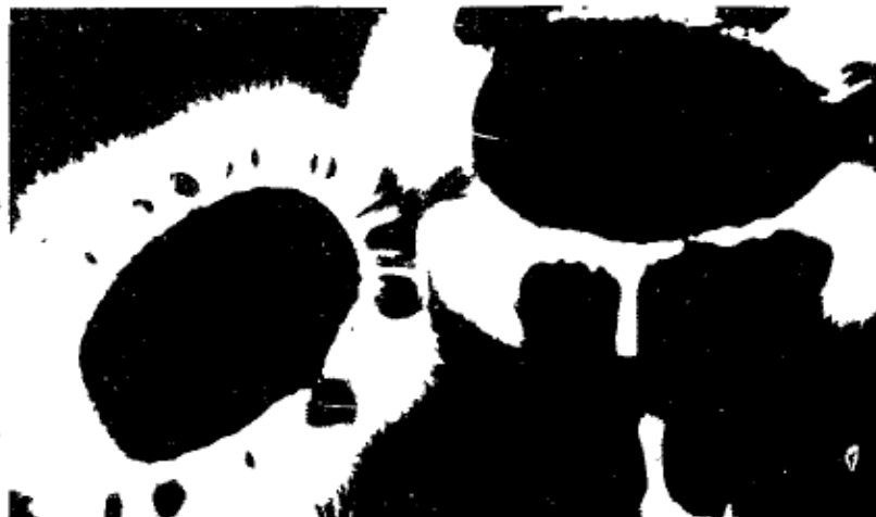
Two persons' fingertips showing attraction (merging of emanations)