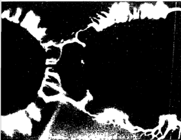
Two persons (attraction)

It is generally believed that the Soviets and their allies are well in the lead in parapsychological research. This belief is supported by a number of popular books that have been on the market for the past 10 years. Not as well-known are two Defense Intelligence Agency reports that