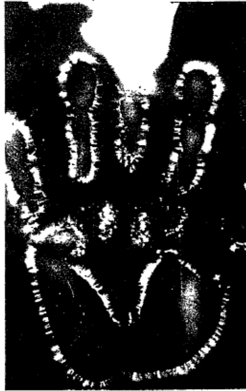
Hand of "healer" sending energy